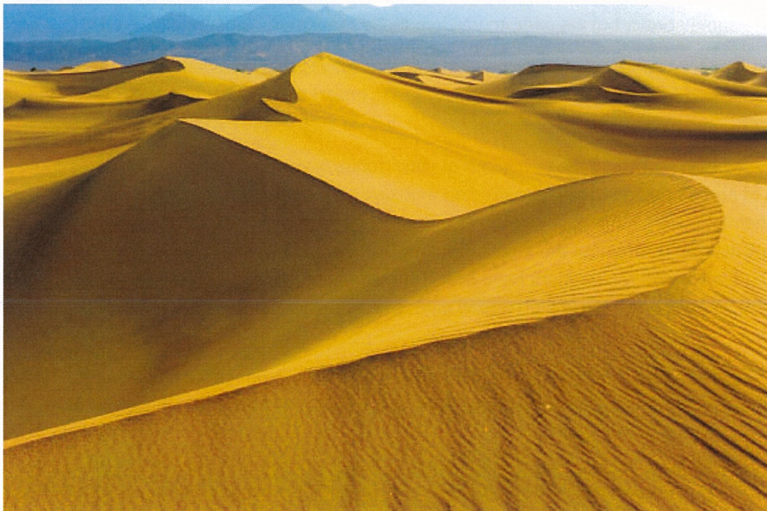
Sand dunes (stock image).

RECEIVED AT PSLU MEETING ON 2/19/20 (COMMITTEE CHAIR)