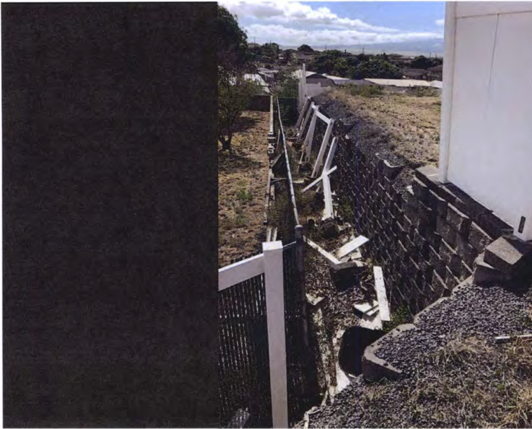
A view from the top of the retaining wall into the swale, showing fencing and cement blocks that have fallen.