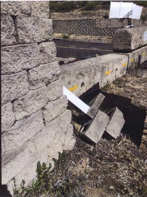
Cement blocks have fallen off the top of the retaining wall, right on the corner of the Kea Street entrance.