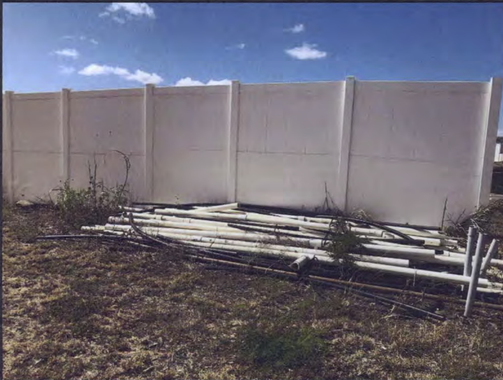
A pile of piping and supplies that has been left out in the open on the outside of the drainage basin security wall.