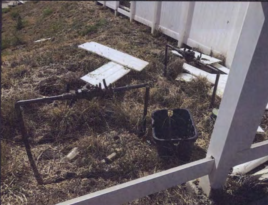
Unlocked and exposed valves at the top of drainage basin next to water meters.