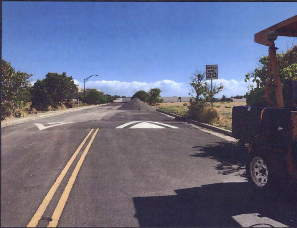
A photo showing a pile of gravel and machinery that is being stored on the roadway of the lots.