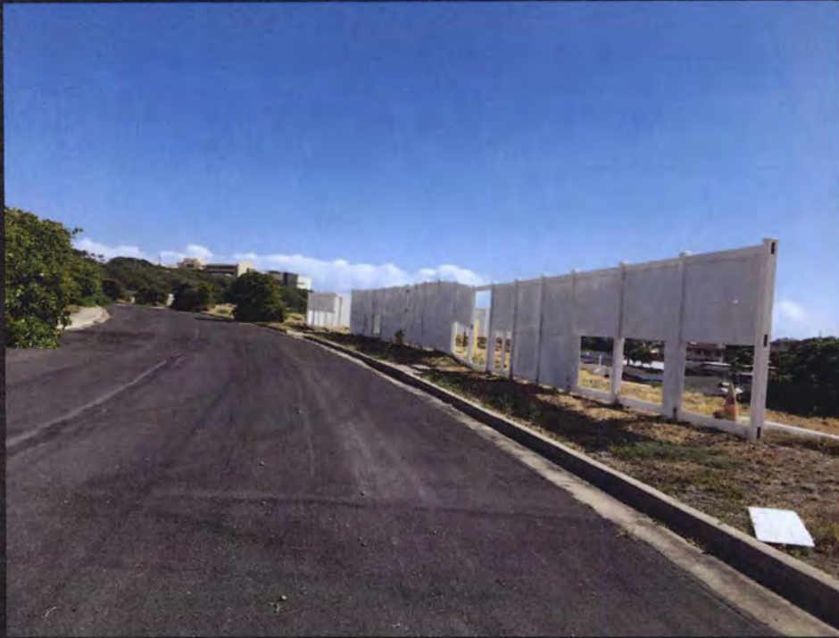
Fencing along the drainage basin in a state of disrepair. Another view from the street.