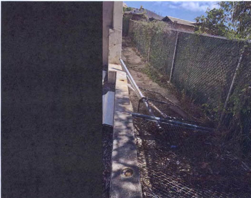
Fencing on the wall bordering the bottom of the drainage basin, further to the left of the previous photo.