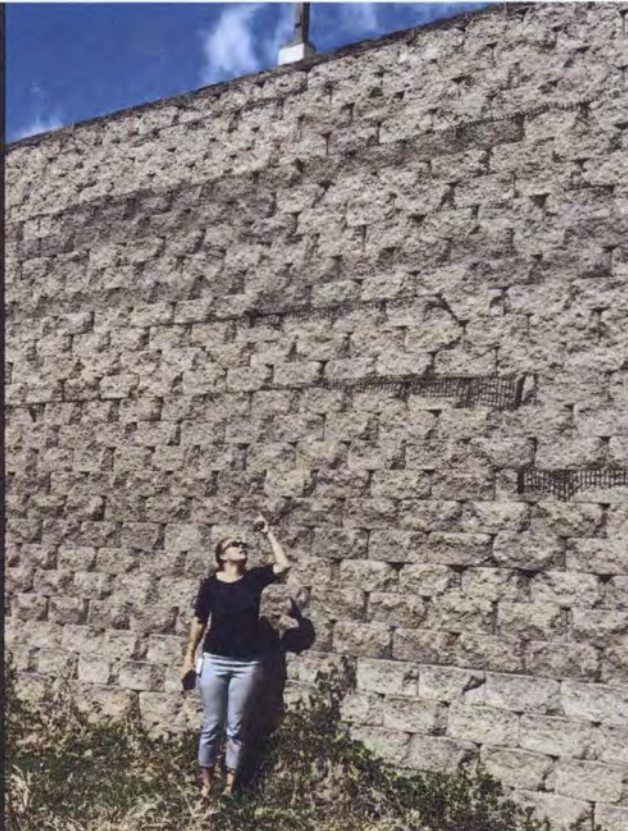
A photo showing the tallest portion of the retaining wall above the drainage basin. Person in the photo is 5'6".