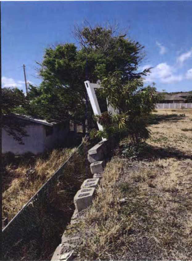
Cement block and the fencing of the retaining wall that are on the verge of falling.