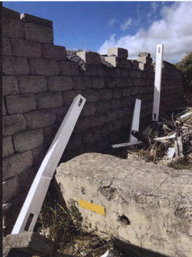
Street entrance cement retaining wall blocks that have fallen with fence posts still attached.