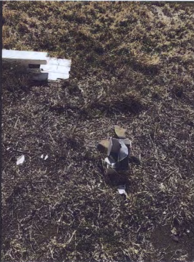
Broken fence post left exposed with rusted and sharp metal sticking out of the ground.