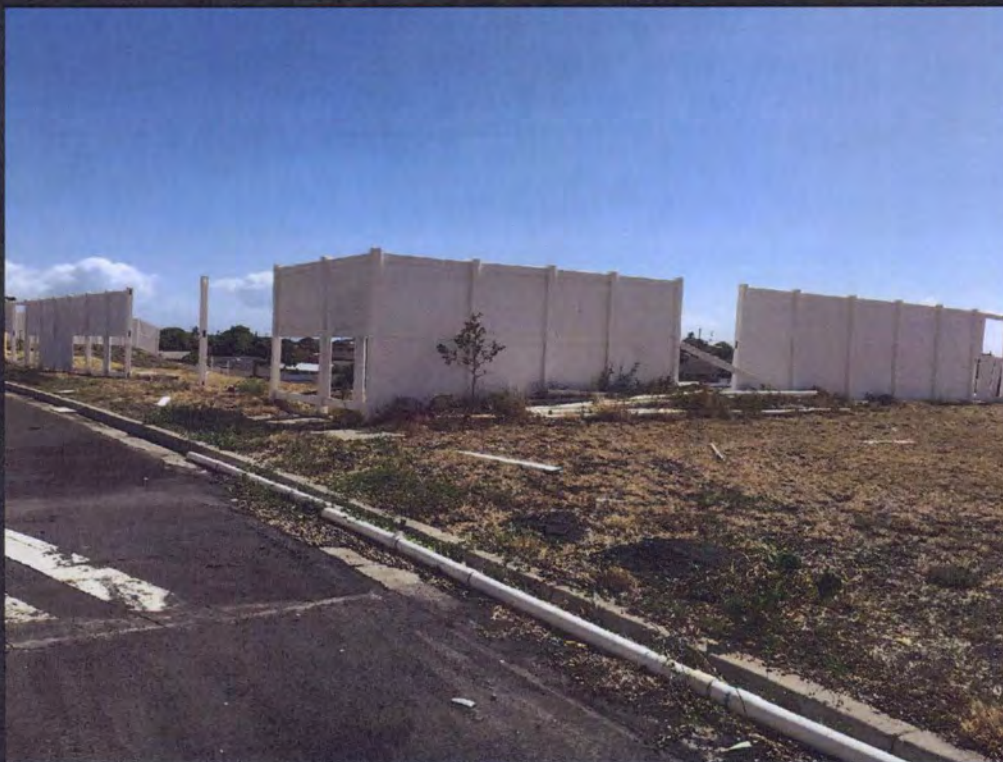
Fencing along the drainage basin in a state of disrepair.