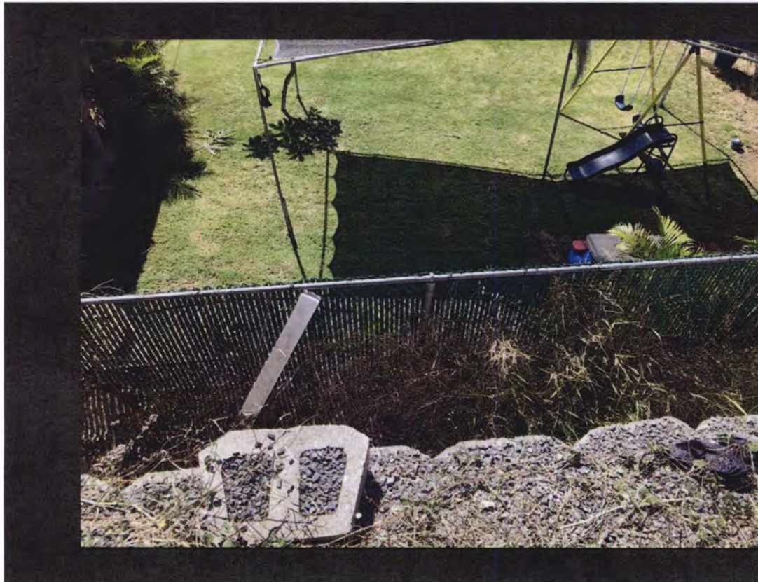
A view of the swale with debris from the retaining wall, right behind a local childcare provider's home.