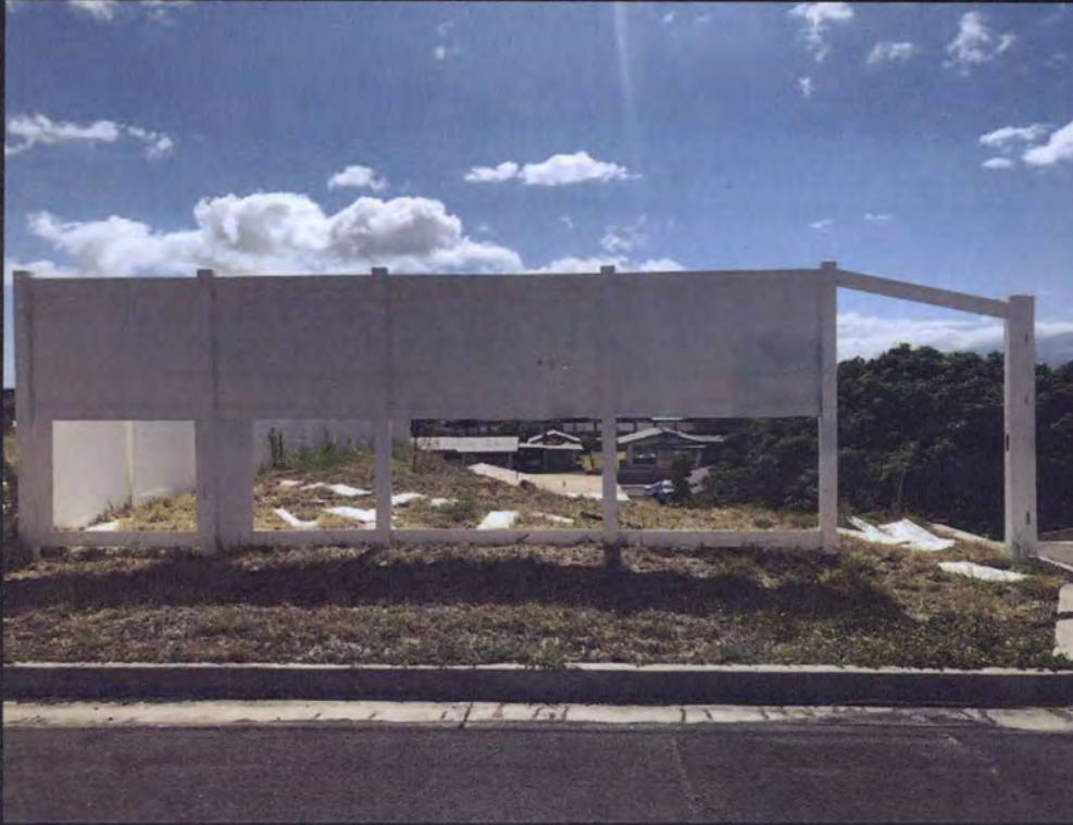
Fencing along the drainage basin in a state of disrepair.