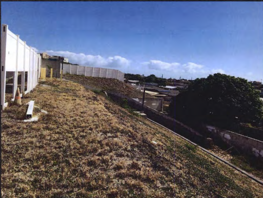
This picture is showing the distance from the fencing above the drainage basin to the retaining wall drop off.