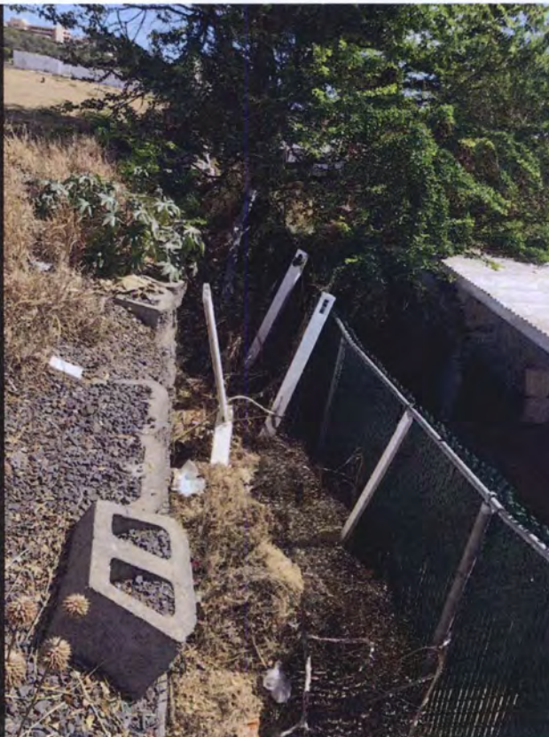
A view from the top of the retaining wall showing debris and the broken fencing and missing parts of the retaining wall.