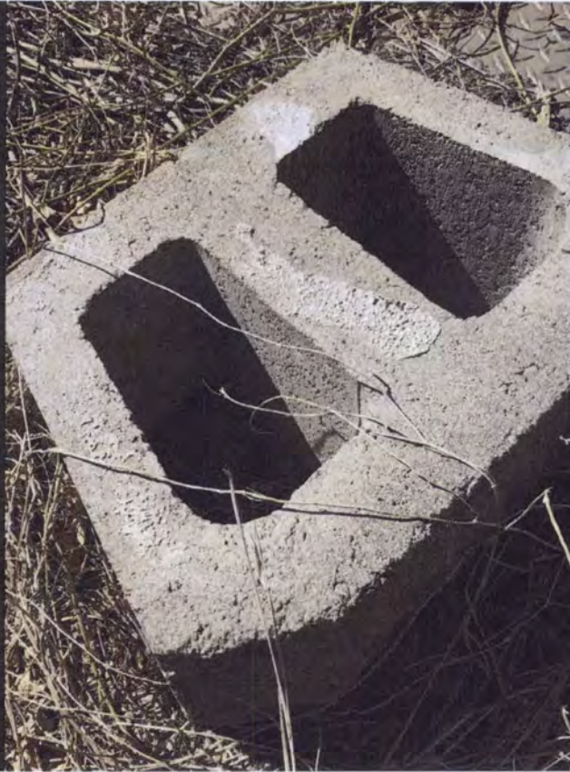
A photo showing the amount of mortar placed on one of the cement blocks that make up the retaining wall.