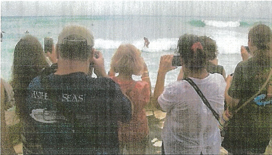
Researchers claim that Hawaii has hit a so-called "tipping point" of overtourism, as increasing numbers of annual visitors are reportedly on the brink of overwhelming the island state's resources.