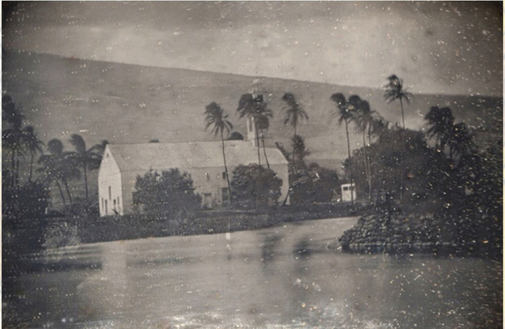
Loko Mokuhinia, Moku'ula & Waine'e Church (Ambrotype ca. 1855)