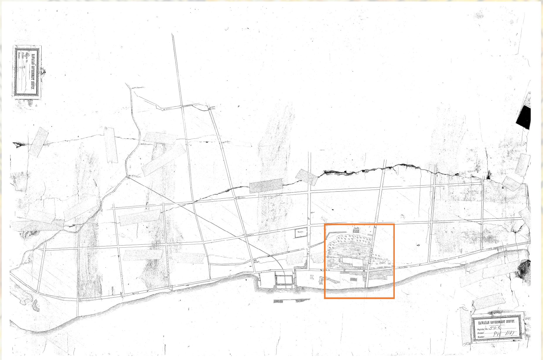
“Lahaina Village Water Works” (Registered Map No. 500). Traditional Complex of Moku‘ula, Loko Mokuhinia, Hale Piula Outlined in Box (No date).