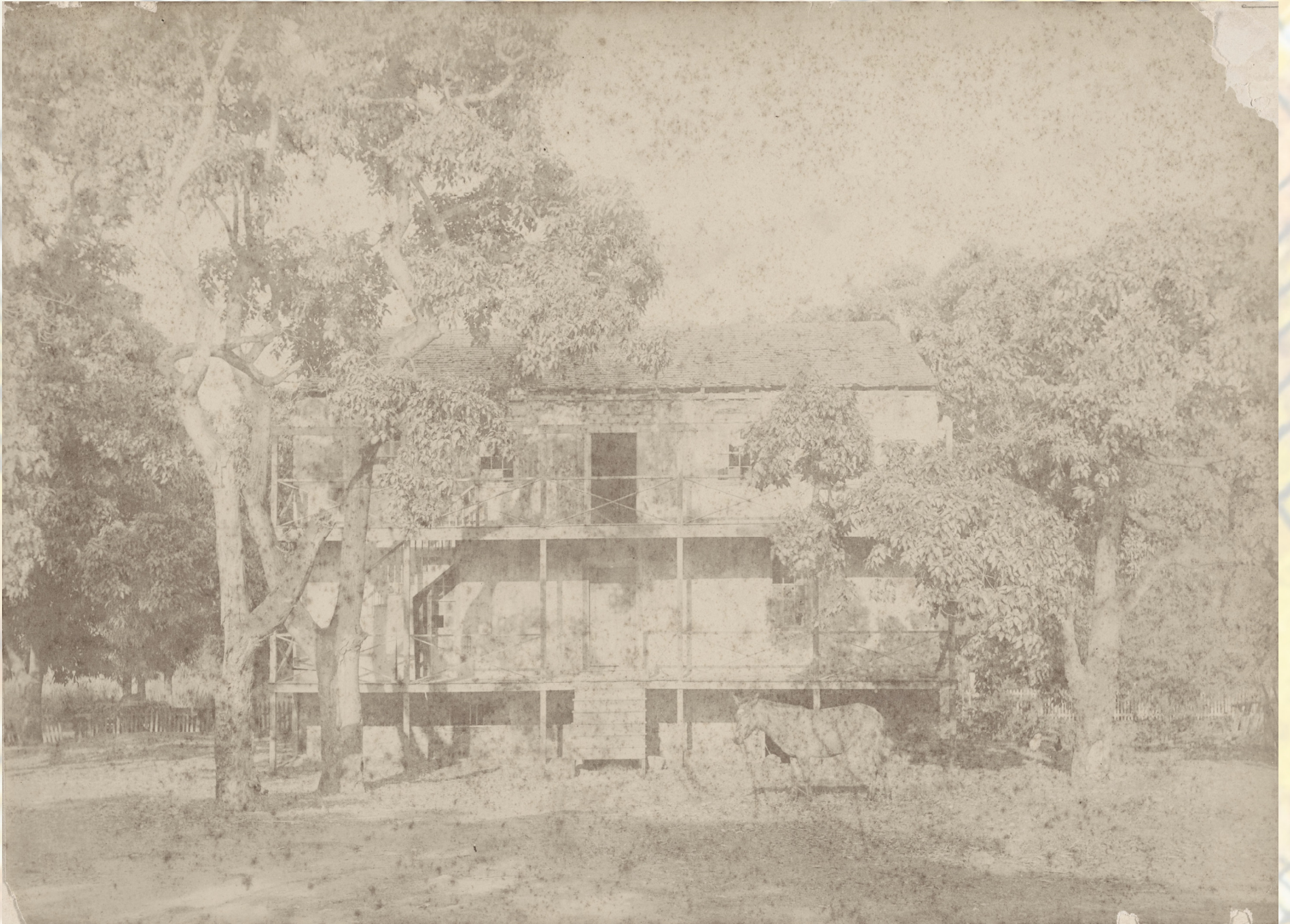
Lahaina: Old Palace & Kukui Trees (Hale Piula).