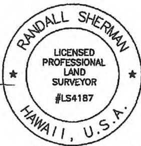
Exhibit Showing LOT 49-A of LAND COURT APPLICATION 632