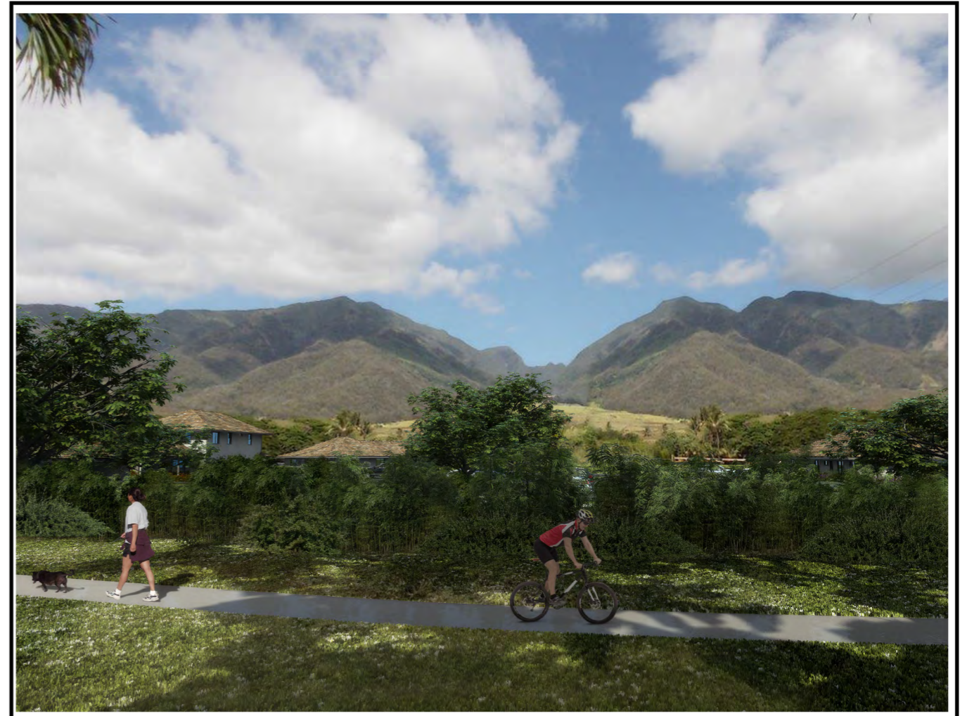
5. After. Looking in a westerly direction through the project with the West Maui Mountains in the background and the separated pedestrian and bicycle path in the foreground.