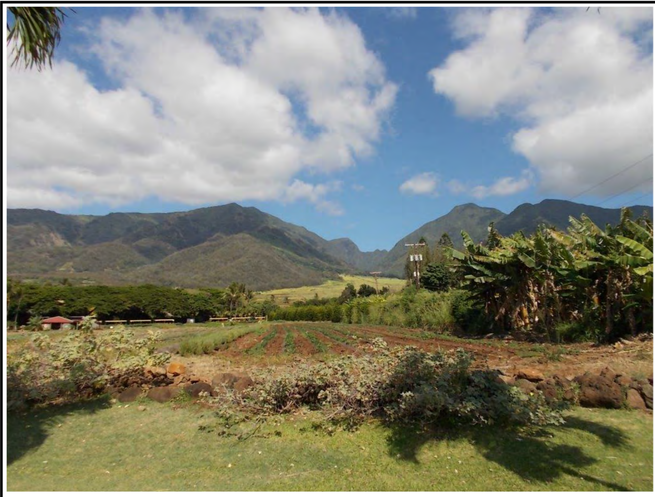
5. Before. Looking in a westerly direction through the MTPs agricultural fields with the with the West Maui Mountains in the background.