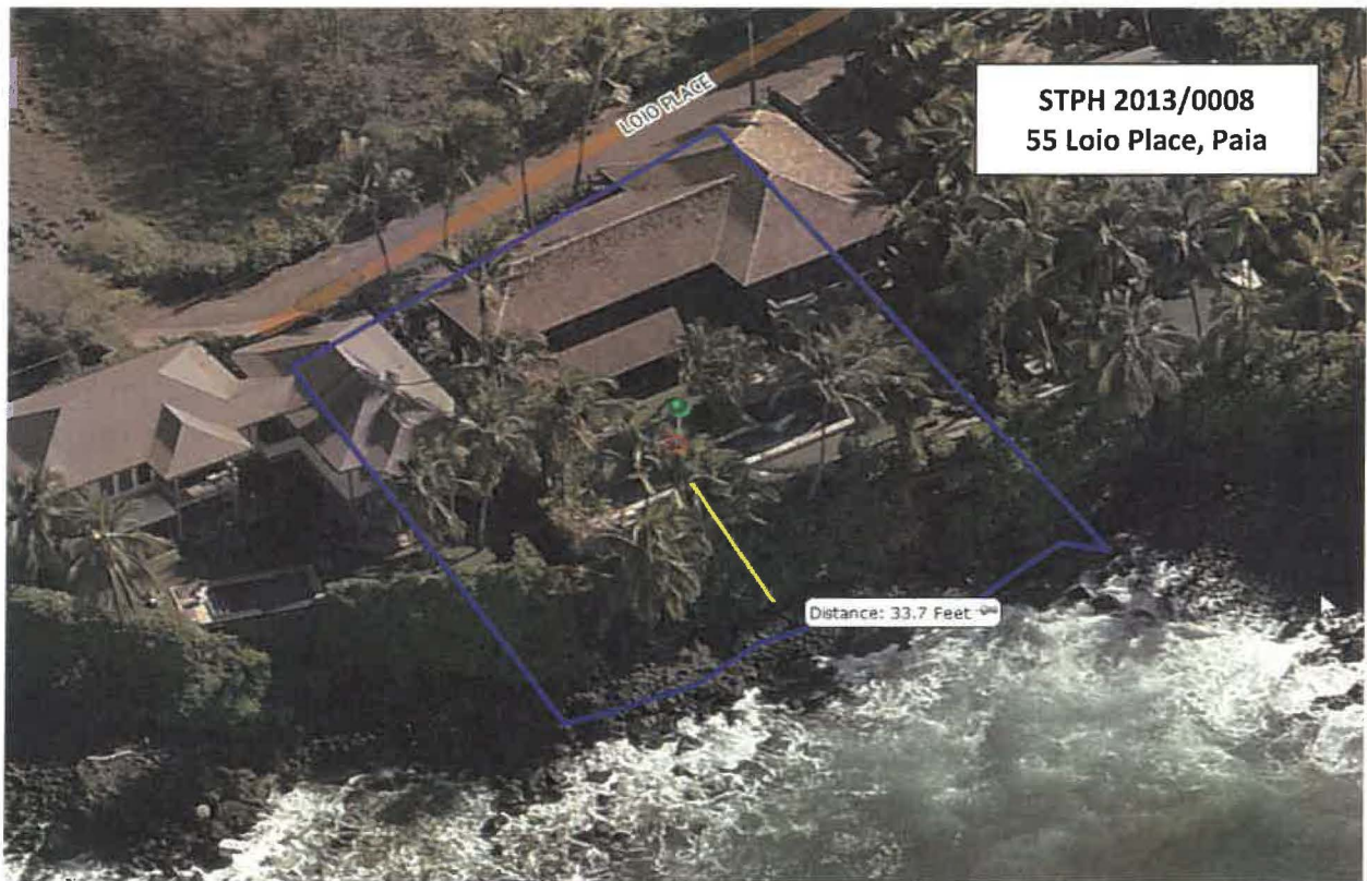
STPH 2013/0008 55 Loio Place, Paia