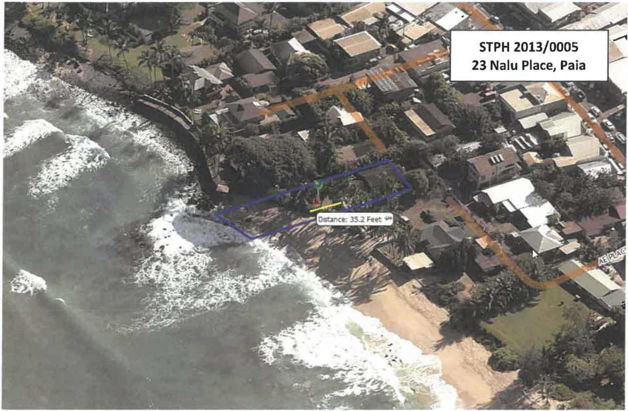
STPH 2013/0005 23 Nalu Place, Paia