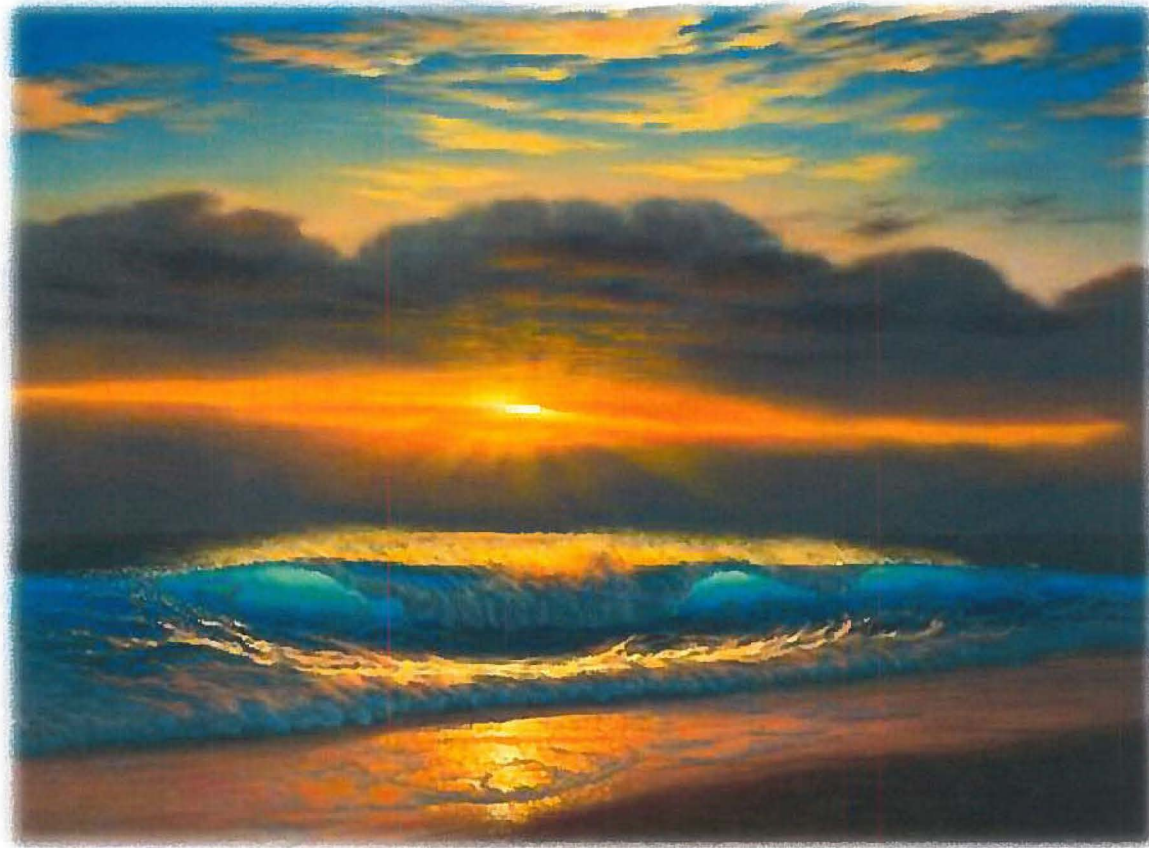
End of a Perfect Day by Wyland