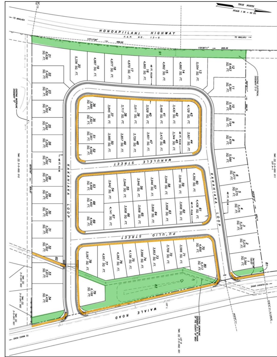
PROPOSED AMENDED SITE PLAN: 80 Single Family Homes on 80 Lots