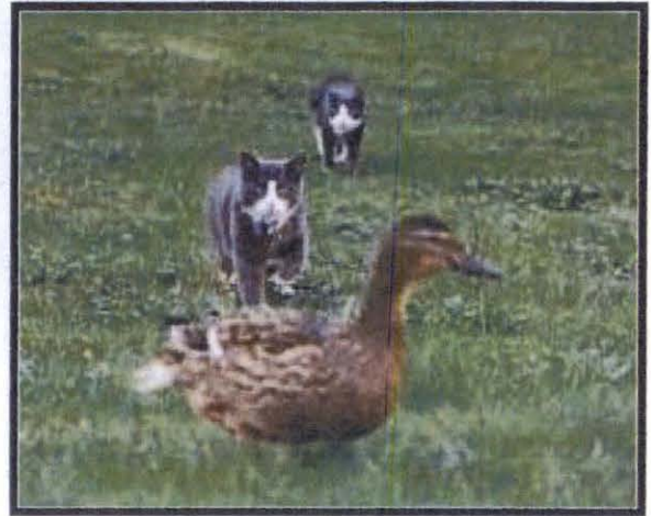
Native Hawaiian species are unaccustomed to cats and do not avoid them