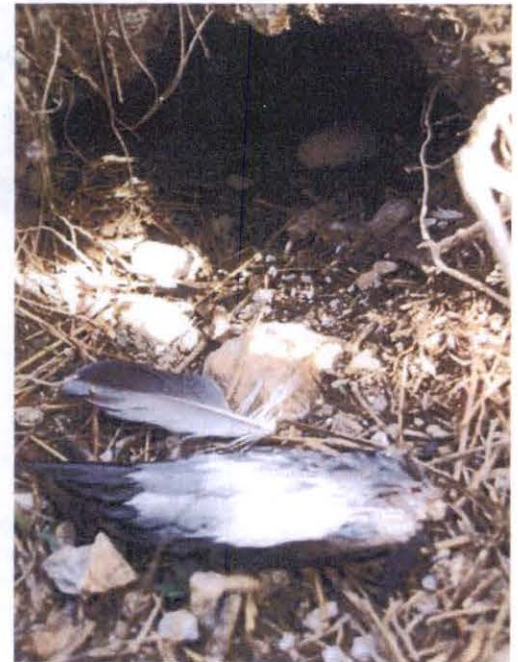
Most seabirds, like these shearwaters, partner for life and lay only one egg per season - and it takes both parents to raise a chick