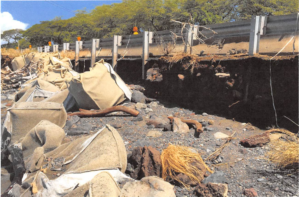
At left center of this photo, the guardrail supports are hanging in the air. Temporary erosion control bags have been scattered by wave action.

Building seawalls at these erosion hotspots is not the answer. Sea level rise will cause any such efforts to be very expensive and ultimately futile in the long run. Shoreline hardening will also cause our beaches to disappear along with our ocean resources and cultural practices. If we do not support DOT in prioritizing the southern extension of the bypass between Olowalu and the Pali, we will end up with a situation where West Maui residents will have trouble getting to the bypass at all.