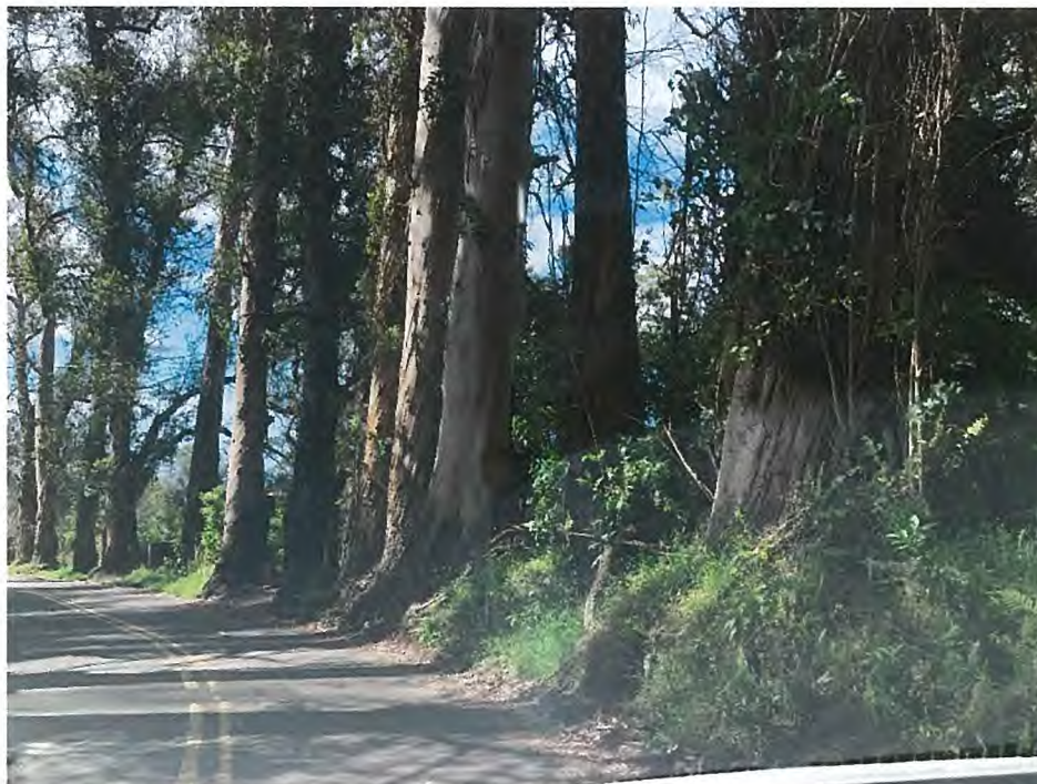
Photo taken, April 6, 2019, Olinda County road.

At the Upcountry budget district meeting on April 4 th , residents expressed concerns of the potential threat of fallen eucalyptus trees along Olinda Road. What would it cost to remove the eucalyptus trees along County's portion of Olinda Road? Does the department have any plans to address this concern? What is your schedule.