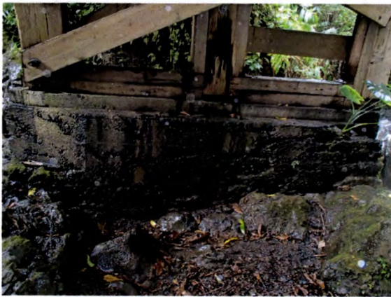
PHOTO 6 CONCRETE PIER WALL