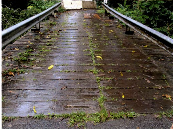
PHOTO 1 4x12 DECK PLANKS AND METAL GUARDRAILS ON BRIDGE