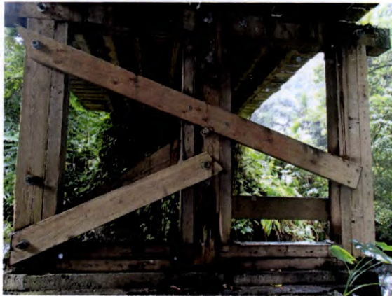
PHOTO 5 TIMBER PIER BETWEEN THE MAUKA AND MAKAI SPANS