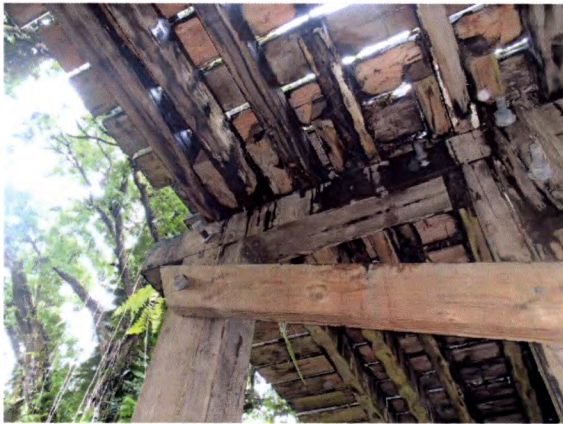
PHOTO 4 6x12 TIMBER GIRDERS LAPPED OVER INTERMEDIATE PIER