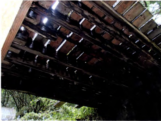
PHOTO 3 MAUKA SPAN