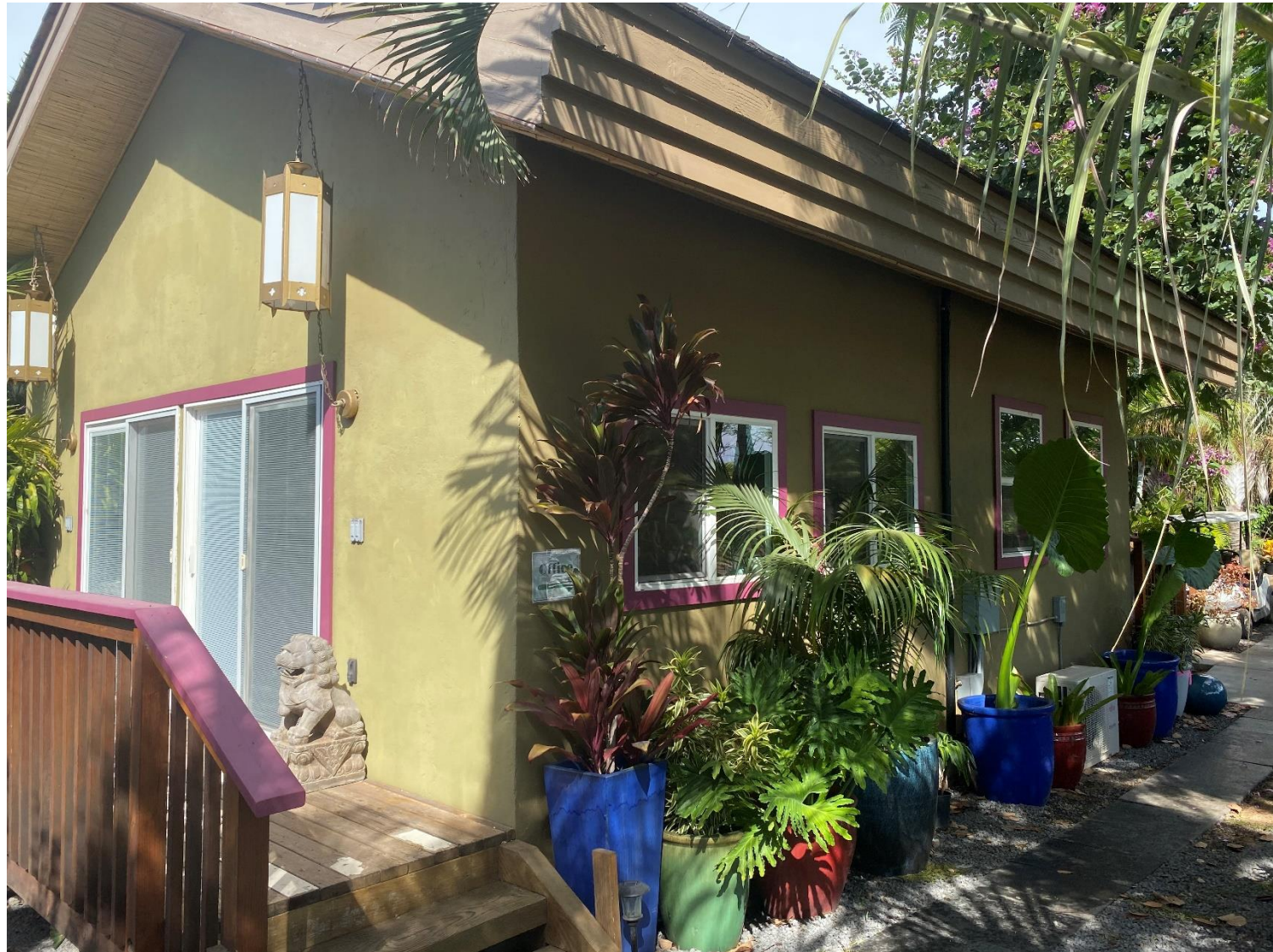
Building #3: Office