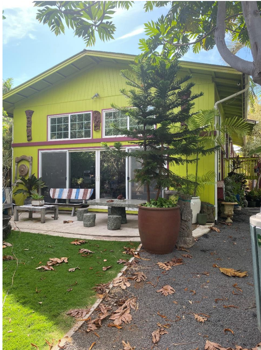
Building #2: Storage