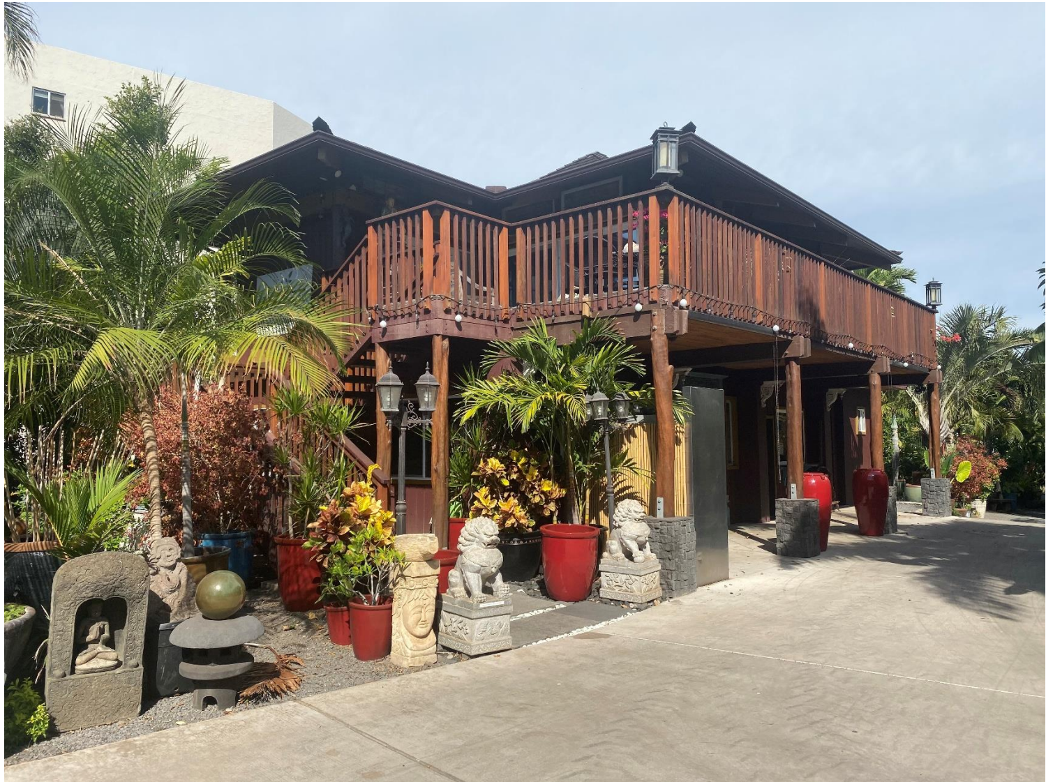
Building #1: Owner's Residence (upstairs) and Former Bakery (downstairs)