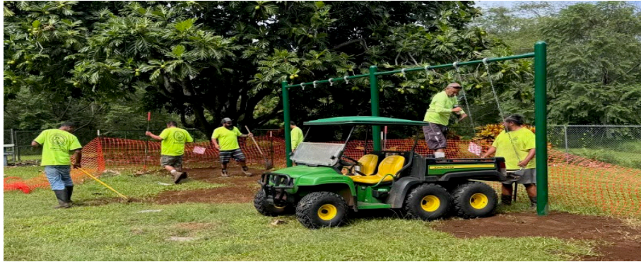
Parks District Maintenance Crew- Hana Parks Crew install of swingset at Pa'ani Mai Park