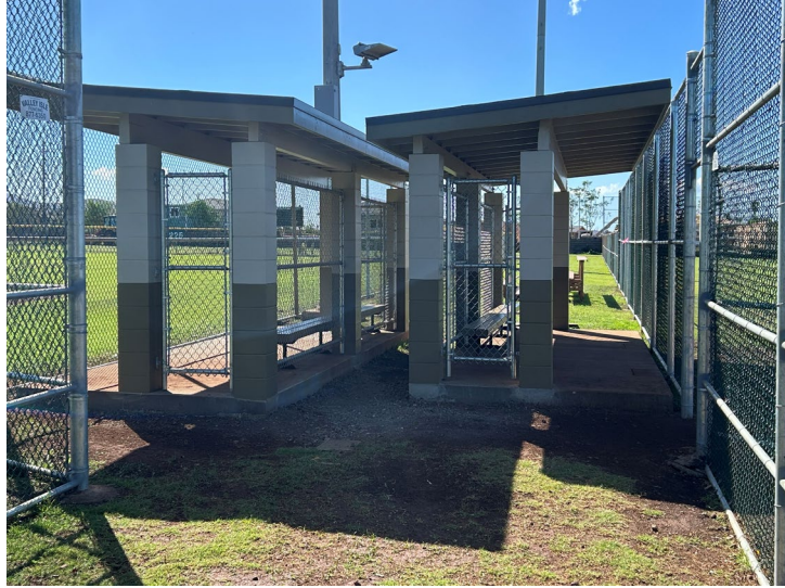
Lahaina Recreation 1 And 2 Dugout Rebuild