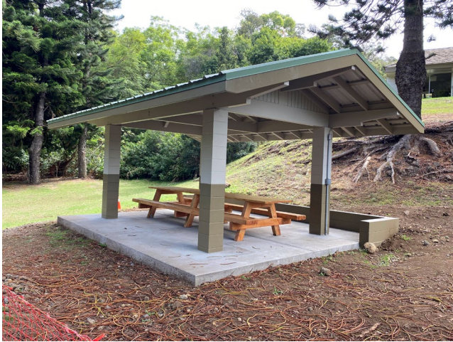
Keokea Pavilion Rebuild