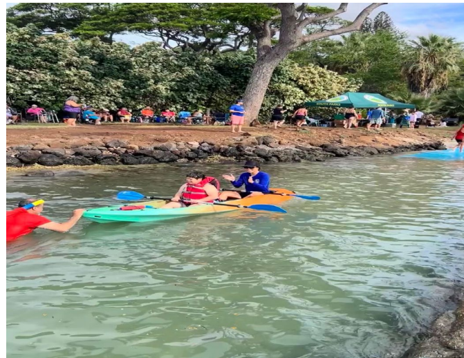
Inclusive Kayak Program- Parks Recreation Staff supporting our Special Needs community with an ocean experience like none other!