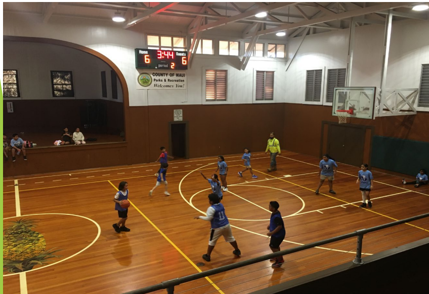
Youth Basketball Program- Lanai Parks