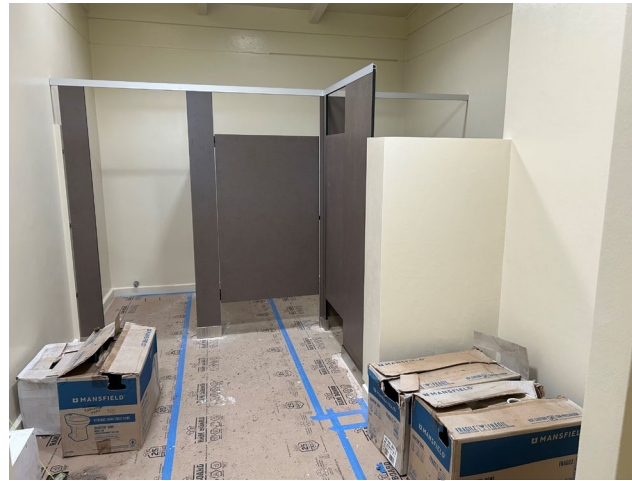
Waiehu Golf Course Women Restroom Remodel