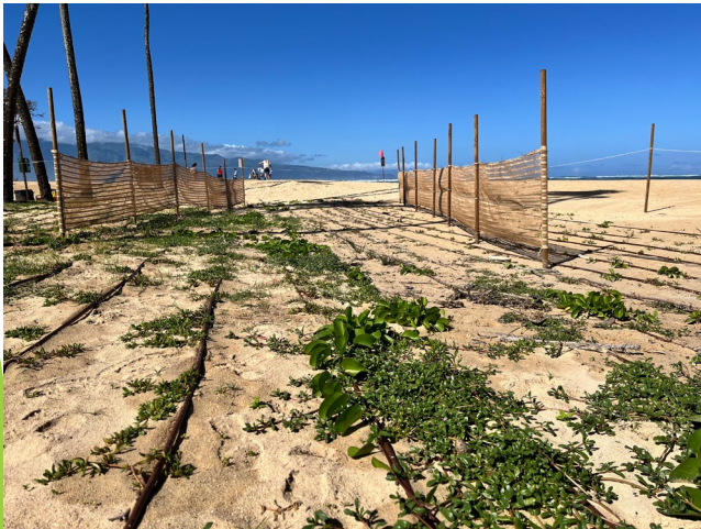
Baldwin Beach Park Dune Restoration