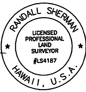
Exhibit Showing LOT 49-A of LAND COURT APPLICATION 632