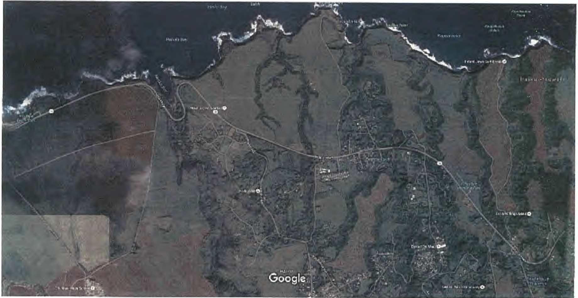
Imatge y ©2016 Google, Map data ©2016 Google 1000 F