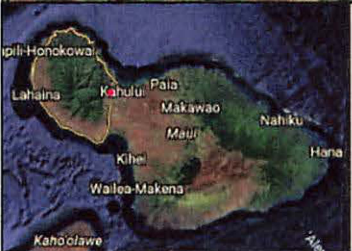
Exhibit W-1 PARK MAUI WAILUKU TOWN Paid Parking Zone