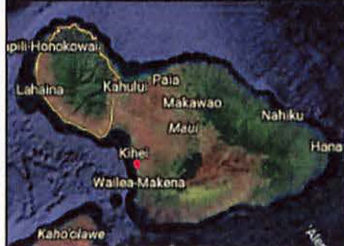
Exhibit SM-1 PARK MAUI KAMAOLE BEACH PARK Paid Parking Zone