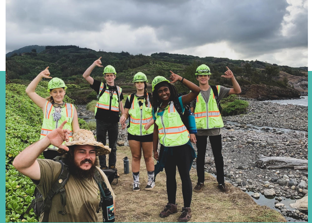
Maui Hero Project