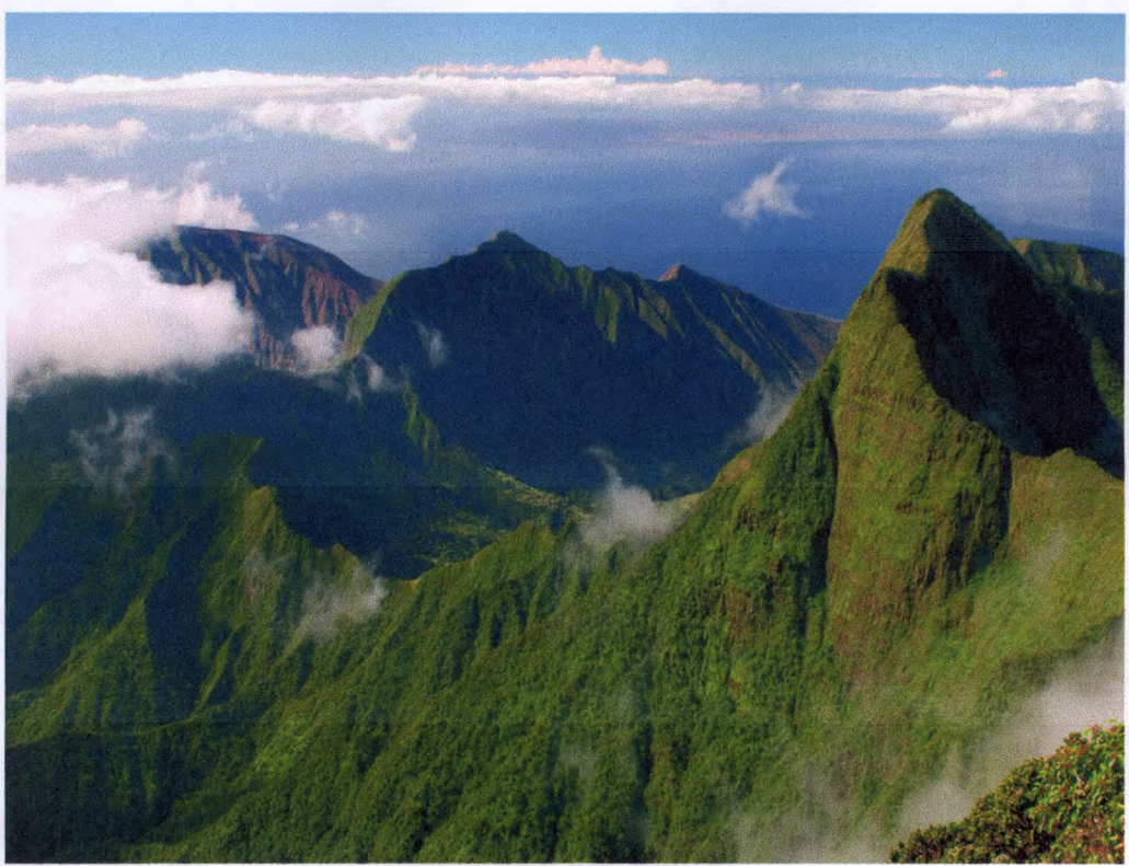
Summit of Pu'ukukui

g. For each infestation, indicate whether the infestation has been completely resolved and if so, the date it was resolved.