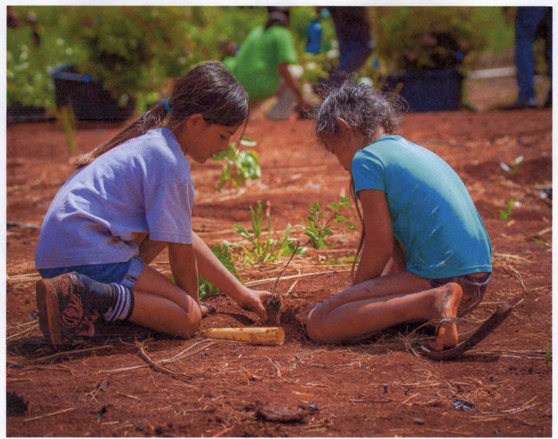
Keiki planting a canoe" (Koa tree).