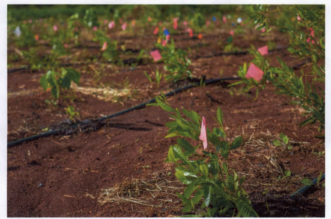
500 volunteers plant 2.5 acres of Hawaiian Mesic Forest in Honolua. Colored flaggings corespond to a native tree species.