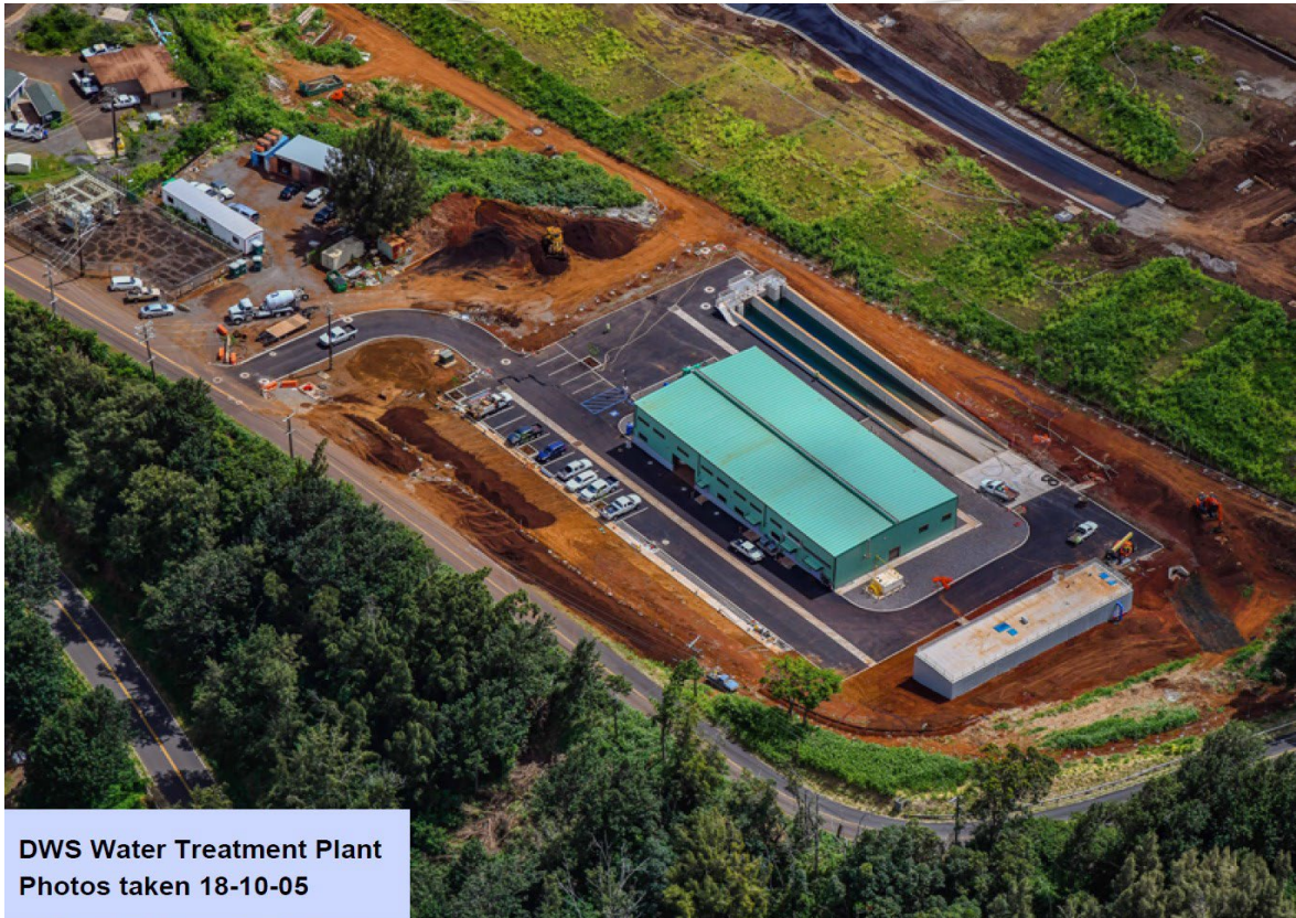
DWS Water Treatment Plant Photos taken 18-10-05