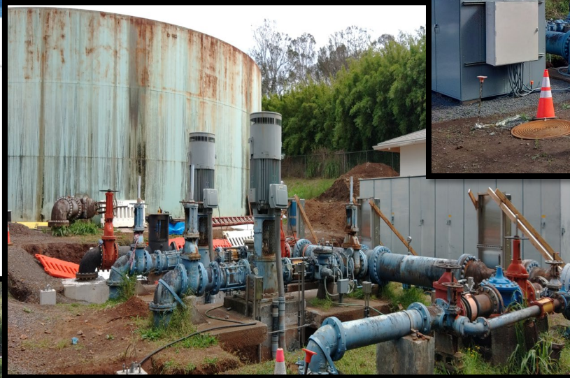
MALUHIA TANK BP STATION