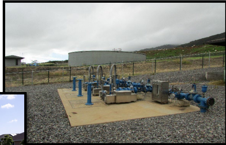
34 Booster Pump Stations