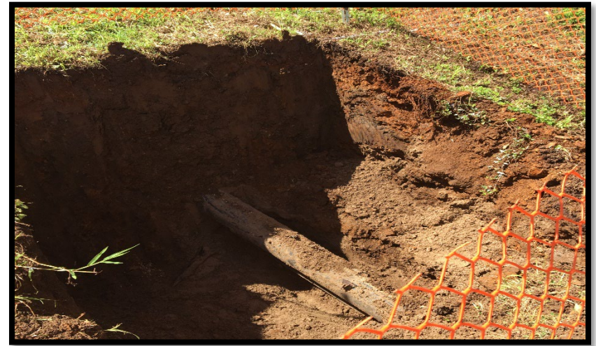
750 Miles of Pipeline