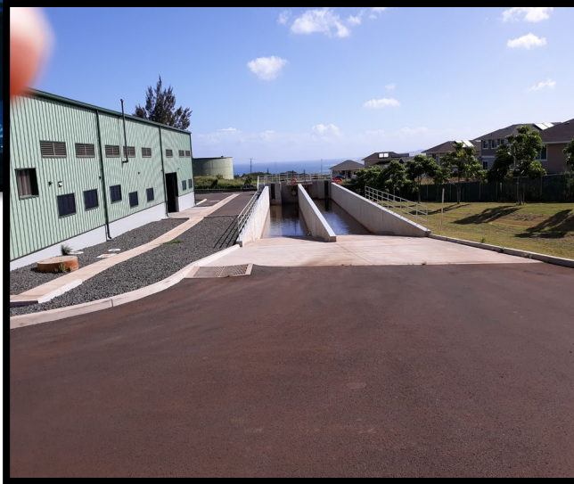
6 Surface Water Treatment Facilities