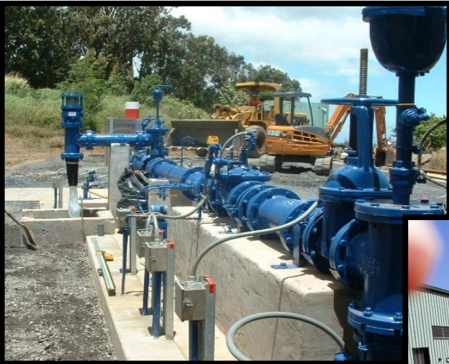
49 Groundwater Sources – Wells - Not all Active -