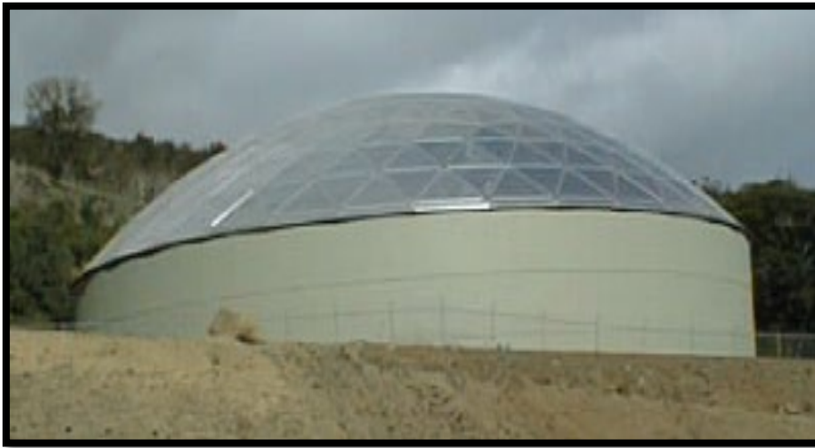
145 Storage Tanks