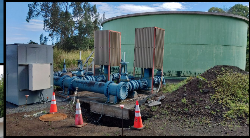
WEST OLINDA TANK