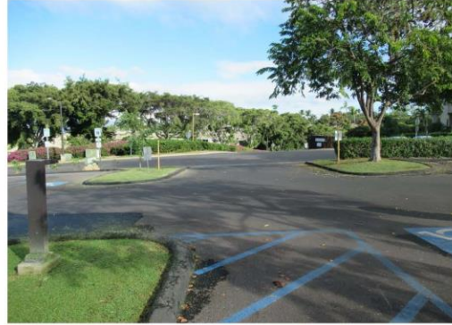
2. Looking north towards the entrance of the Wailea Tennis Club Parking Lot. Beyond is the intersection of Wailea Ike Place that runs to the south connected to Wailea Ike Drive and Wailea Ike Place that runs to the north connected to Grand Champion Villas.