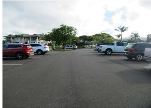
4. Looking east towards the mountain from within the Wailea Tennis Club Parking Lot. AC Hotel by Marriott (right) and Building D of the Wailea Town Center (left).