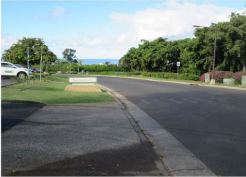
1. Looking west towards Wailea Ike Place and the ocean from the entrance of the Wailea Tennis Club Parking Lot.