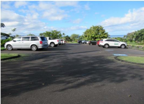
3. Looking west towards the ocean from within the Wailea Tennis Club Parking Lot. Two (2) ADA stalls with access aisle are seen on the right.