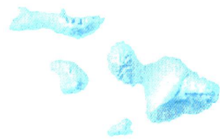
RICHARD T. BISSEN, JR. Mayor, County of Maui

RECEIVED 2023 SEP -8 AM 10:16 OFFICE OF THE COUNTY CLERK