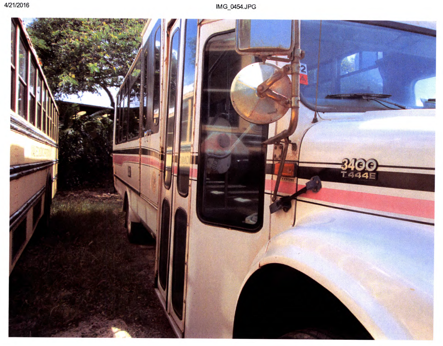
3 of 4