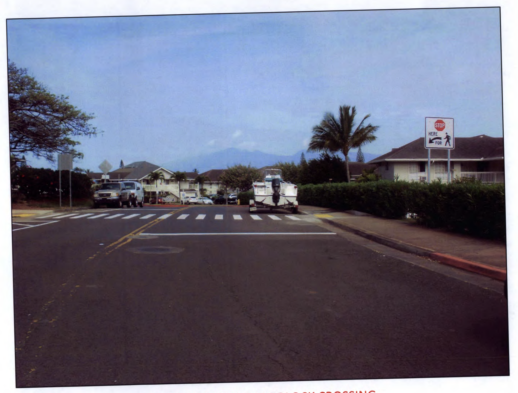
HANAWAI STREET MIDBLOCK CROSSING (NAPILI)