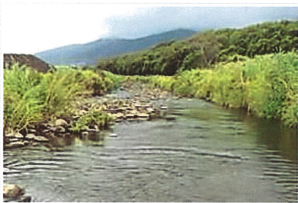
Water flows in Wailuku River just upstream of Waiehu Beach Road.