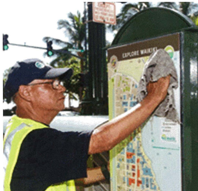
Maintenance and graffiti removal Waikiki