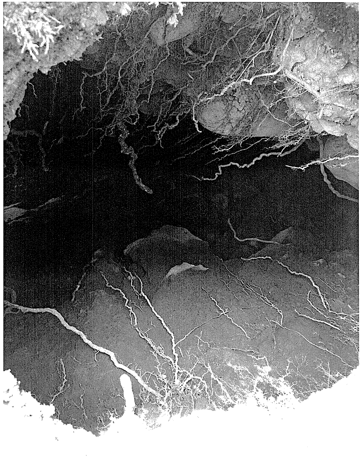
e e e