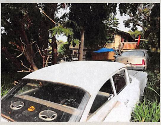
Houses that are dumps.

Houses shown here are just a few examples of many.