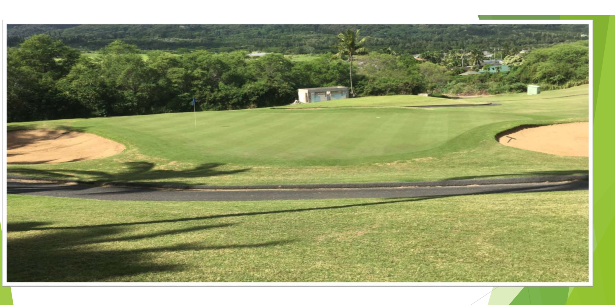
#13 Green After