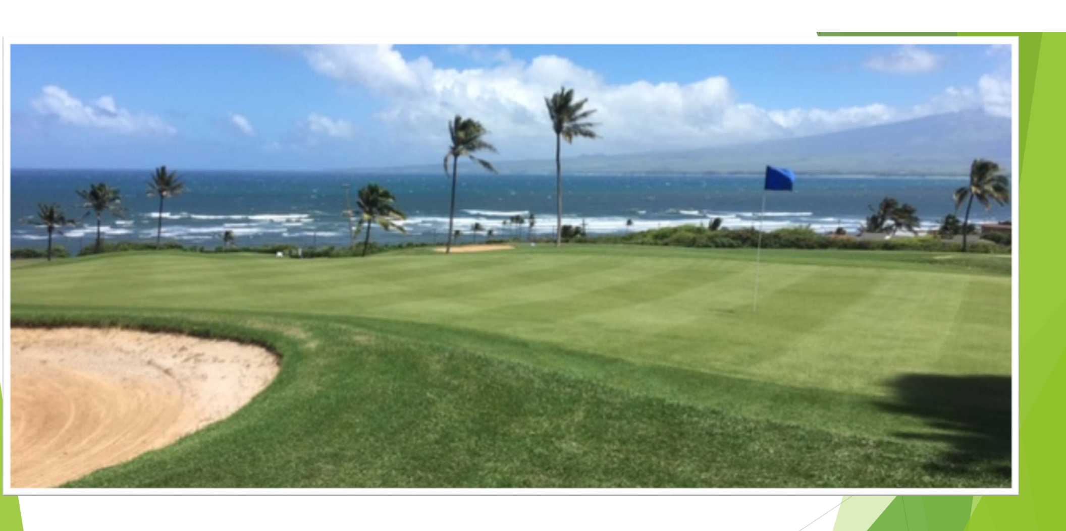
#16 Green After