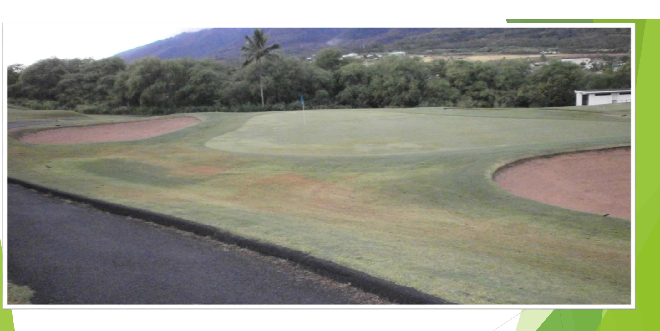
#13 Green Before