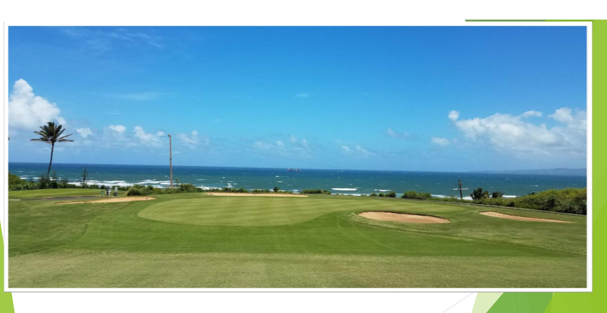
#15 Green After