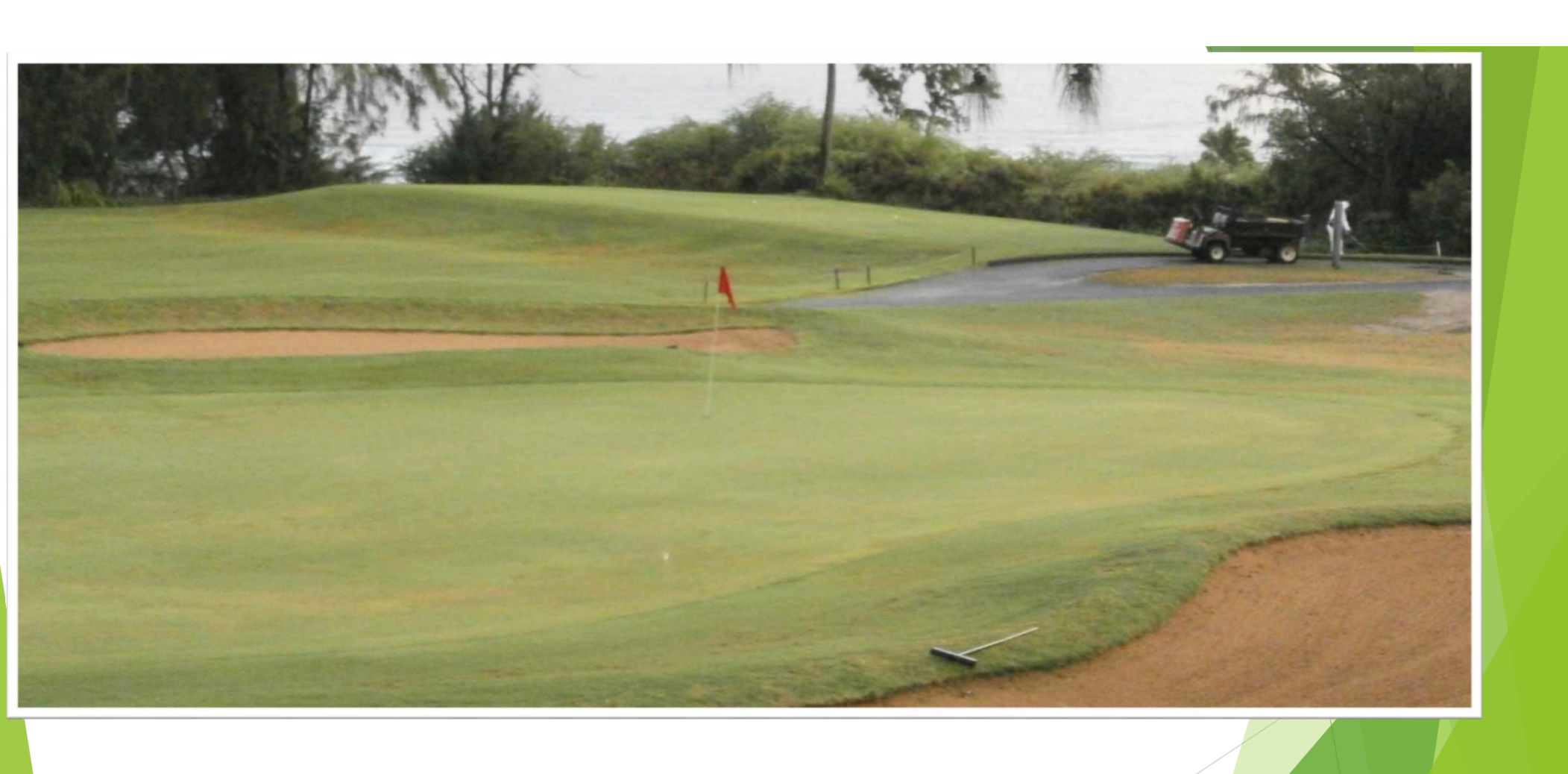
#17 Green Before