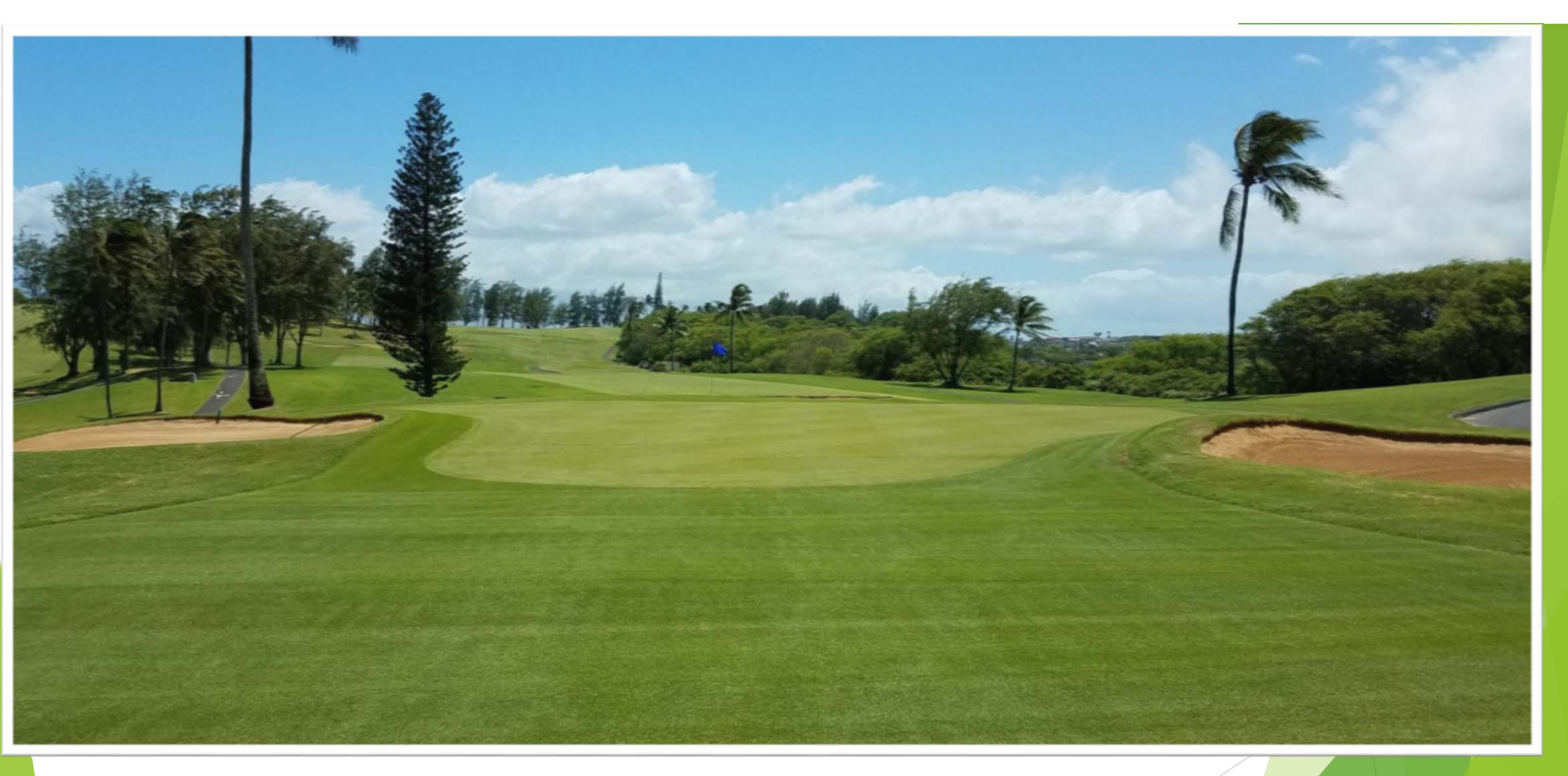
#12 Green After