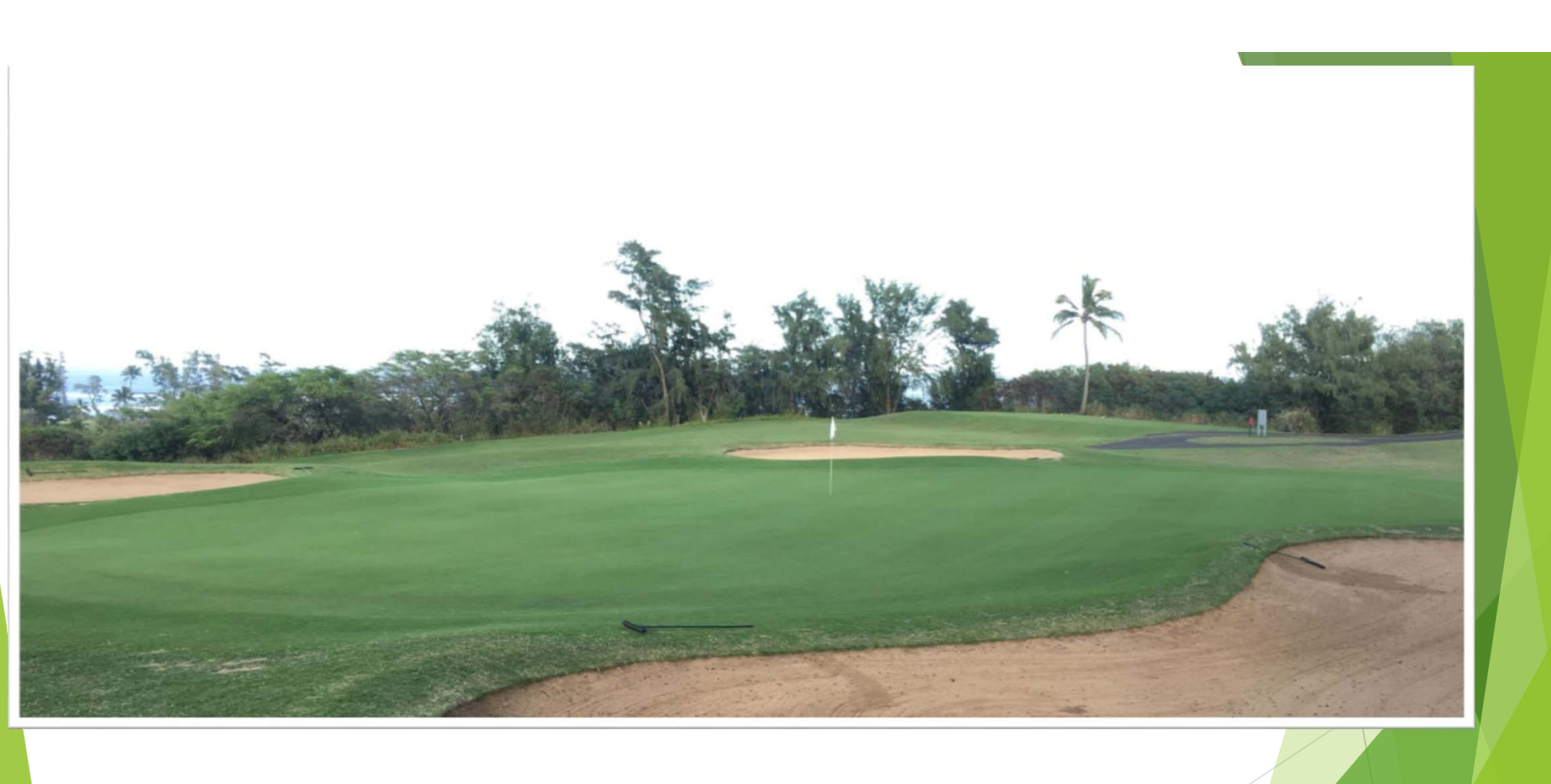
#17 Green After