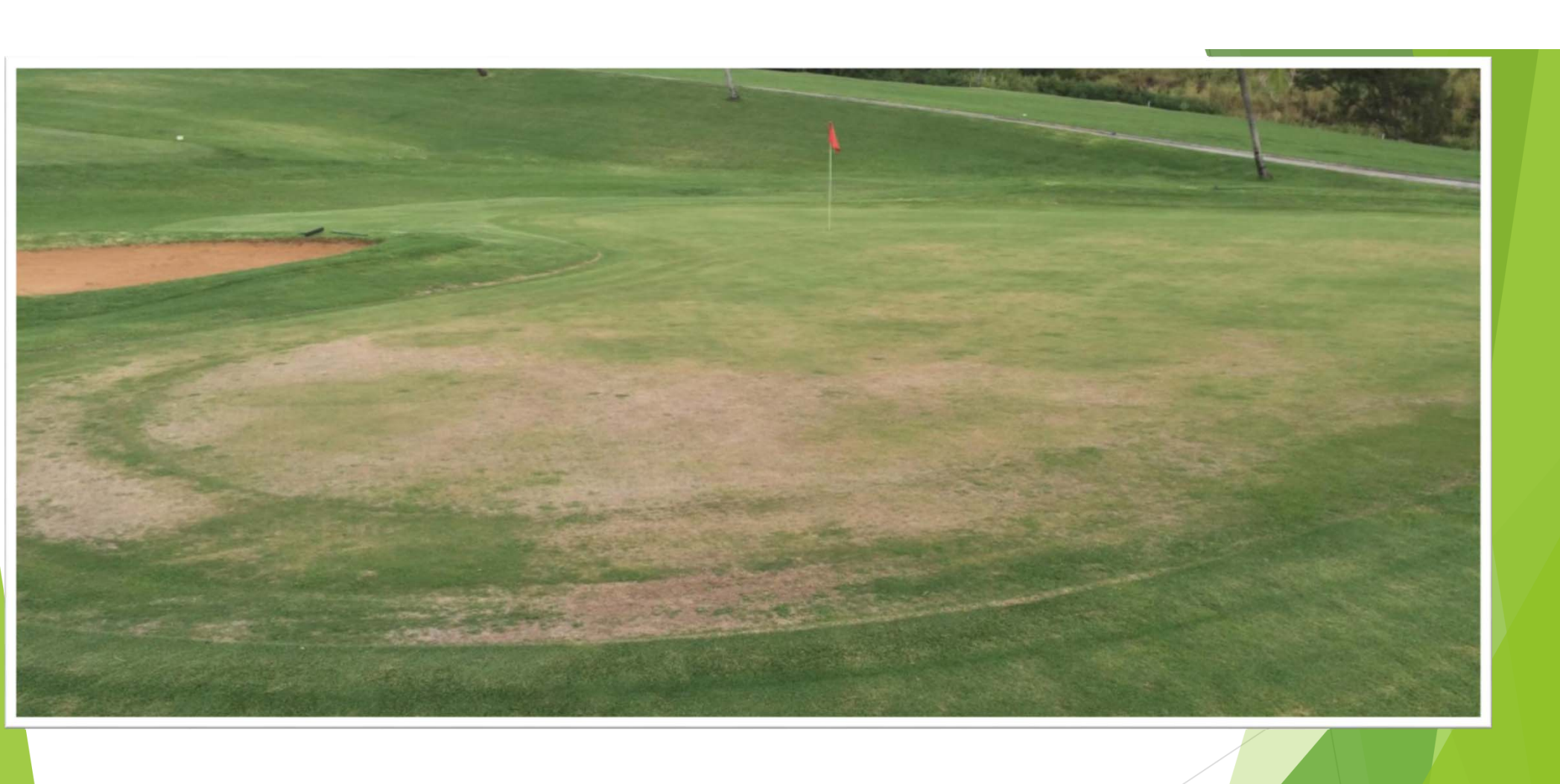
#15 Green Before