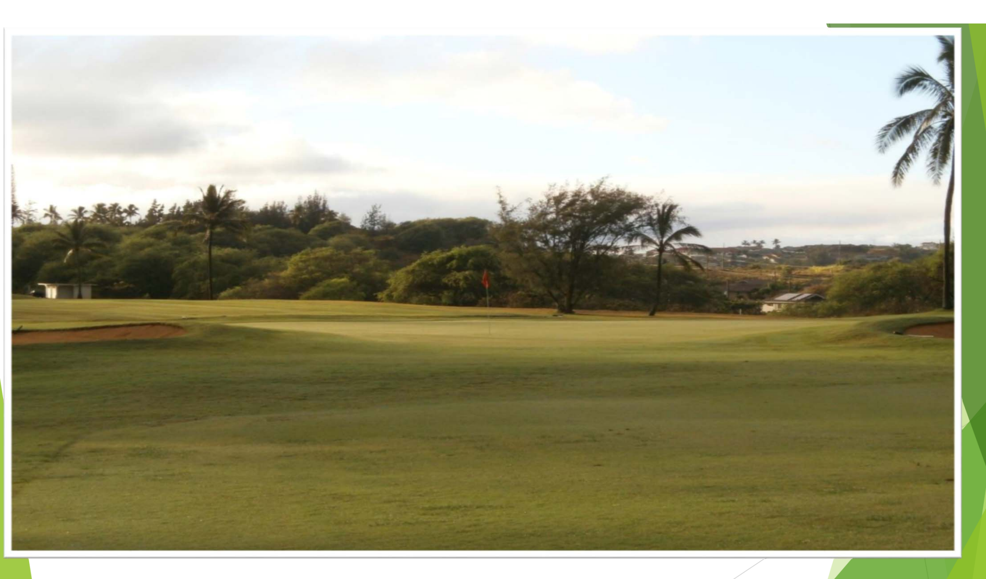
#12 Green Before