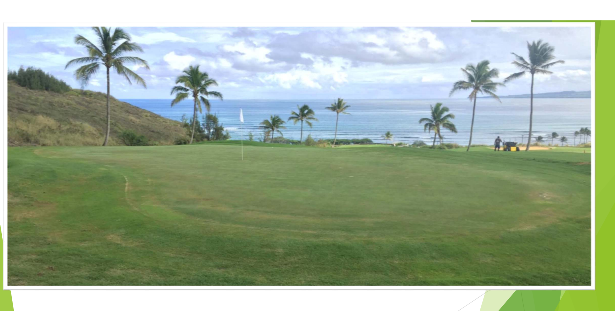
#16 Green Before