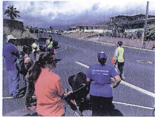
May 30, 2018 walk audit of Kea St & Onehe'e Ave