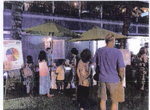
Hele Mai Maui pop-up planning event at Lahaina Town Friday