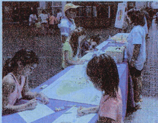
Hele Mai Maui 2040 Long Range Transportation Plan outreach in Kahului