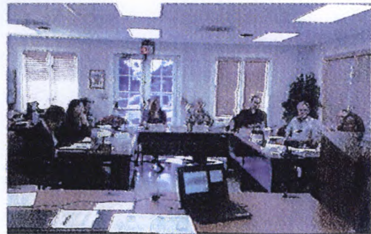
Maui MPO Policy Board

Maui MPO Executive Director and staff administer the MPO to facilitate a comprehensive planning and budgeting process for federal-aid transportation projects on Maui. The Executive Director works with committee chairs to prepare agendas and materials for Policy Board and TAC meetings. MPO staff prepare financial reports, reimbursement requests and supporting memoranda to inform Executive Director and Policy Board decisions, and to ensure timely expenditure and reimbursement of planning funds as approved in the Unified Planning Work Program (UPWP).