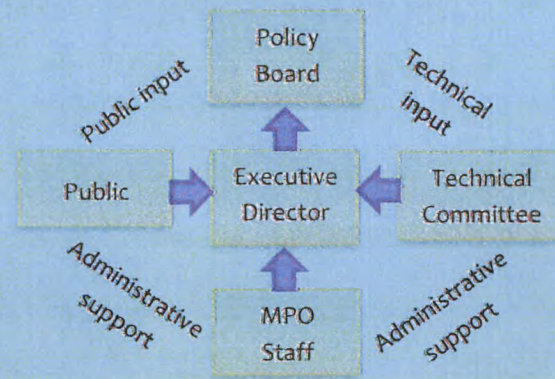
Maui MPO Structure

The Maui MPO Policy Board is the decision-maker on the use of federal-aid transportation funds on Maui. The Policy Board is served by an Executive Director and staff, as well as a Technical Advisory Committee (TAC). Participating agencies include the County of Maui and the State of Hawaii. Maui MPO is administratively tied to the County Department of Transportation.