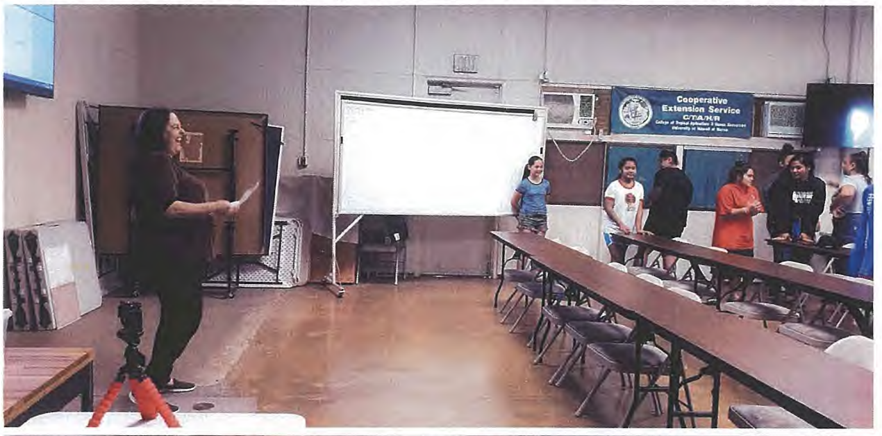
Pictures from Youth Beekeeping Workshop to MEO Youth Services, 12/27/2018