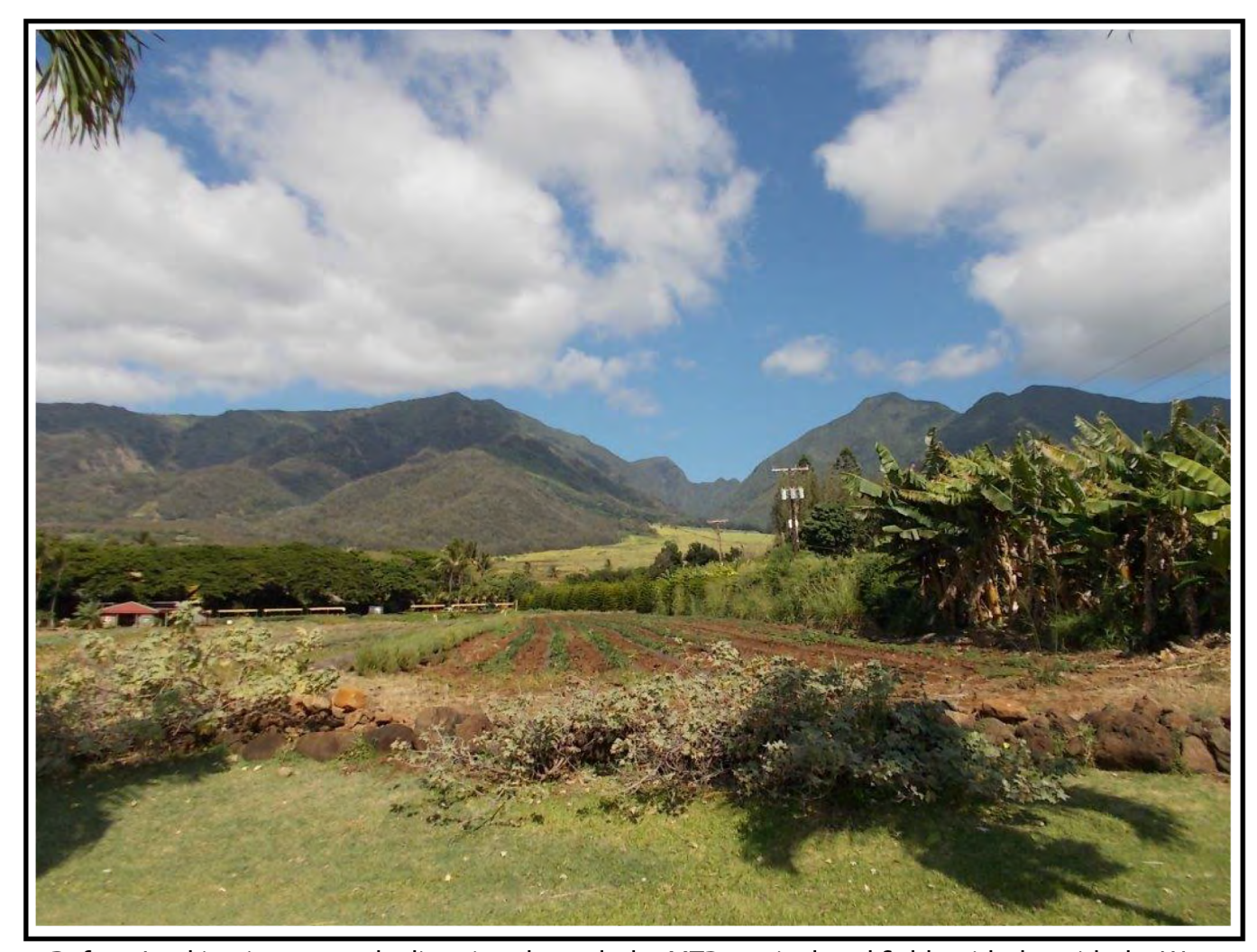
5. Before . Looking in a westerly direction through the MTPs agricultural fields with the with the West Maui Mountains in the background.