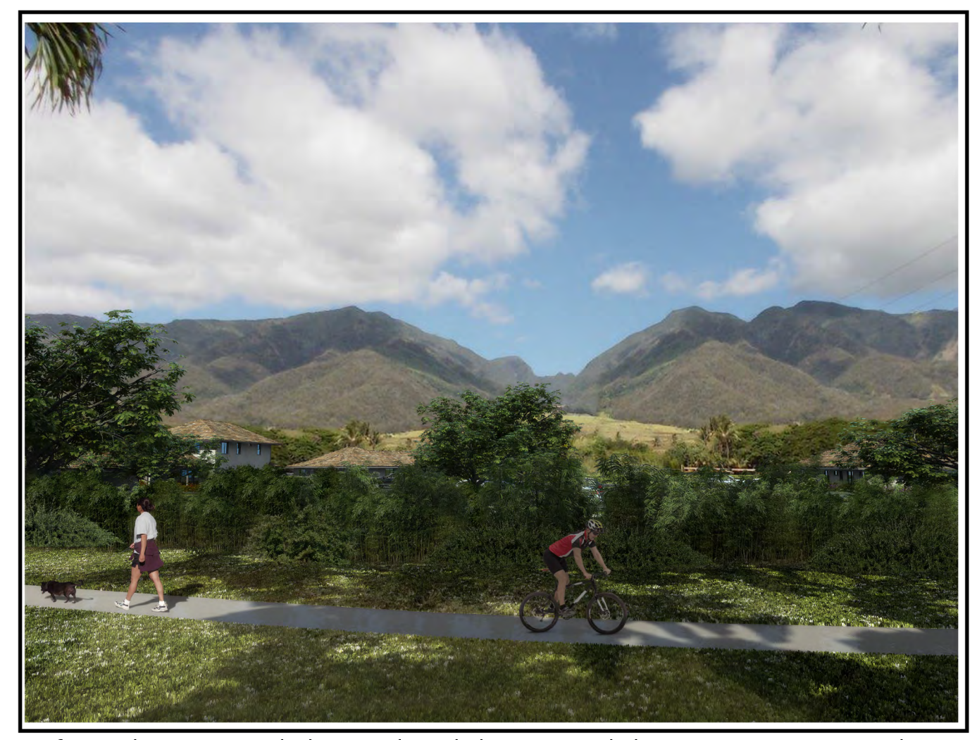
5. After . Looking in a westerly direction through the project with the West Maui Mountains in the background and the separated pedestrian and bicycle path in the foreground.