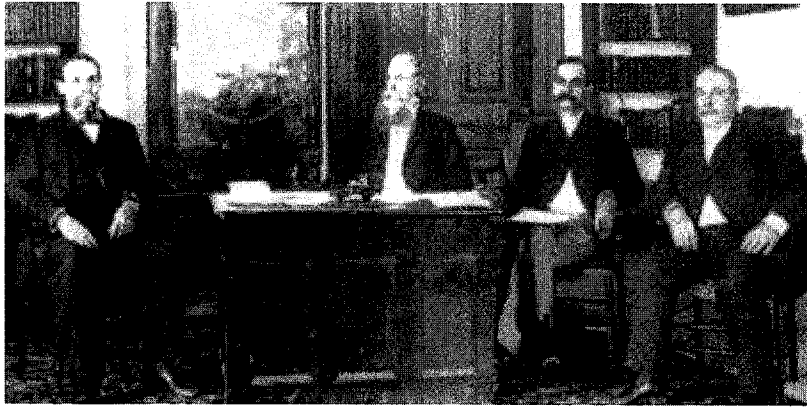
Executive Council of the Provisional Government

overthrown, the sentiment of the people toward existing authority, and, in general, all that can fully enlighten the President touching the subjects of [his] mission (p. 1185)." After arriving in the Hawaiian Islands, he began his investigation on April 1, and by July 17, the fact-finding investigation was complete with a final report. Secretary of State Walter Gresham was receiving periodic reports from Special Commissioner Blount and was preparing a final report to the President.