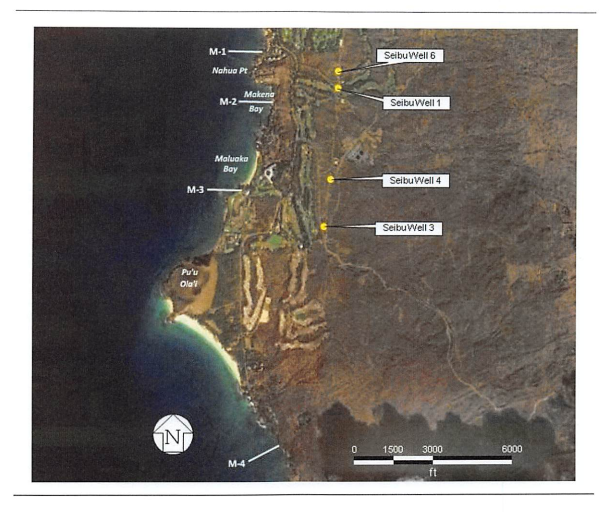
Figure 1.Location of quarterly water quality transects (M-1 through M-4) and irrigation wells.