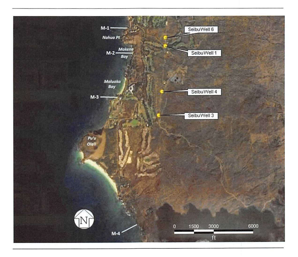
Figure 1. Location of quarterly water quality transects (M-1 through M-4) and irrigation supply wells at MG&BC.

hours) was mostly sunny; ~5% cloud cover became about 60% by 1300 hours. Winds were variable throughout the day: 0–5 mph with occasional 10 mph gusts. NOAA forecast 3-4 ft waves for May 23, 2019. Surf was 1-3 ft along Transect M-1 breaking at about 160 ft from shore. Surf 1-3 ft along Transect M-2 breaking nearshore and creating a turbidity plume. Surf was 1-2 ft along Transect M-3 with a floating algal mass, possibly Cladophora serica , occurring from shore to about 160 ft offshore. This algal mass likely drifted south from north Kīhei waters where it is known to occur as a problem species. Surf at Transect M-4 was about 2-5 ft breaking near 300 ft from shore. The tide was falling during part of the sampling event (0900-1055 hours) from a predicted high of +0.77 ft at 0443 hours to a low of +0.12ft at 1055 hours (Mākena Station; NOAA, 2019).