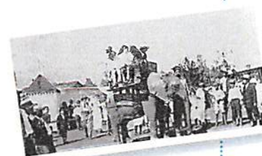
The first county fair was held at Wells Park in 1910. The star attraction was Daisy the elephant.

The Wailuku Gym was the place if you were a kid living in town and the pool was where you learned to swim. Times have changed since those days and the park doesn't quite have the